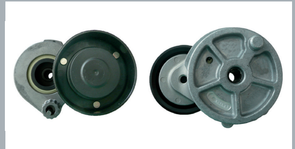
Figure 1: Previous design

During the transition period, we may have mixed stocks of both types.